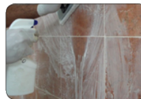
Note: Do NOT allow to dry on surface - add water or product as required.