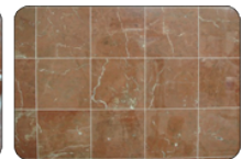
Step 5: Rinse thoroughly with clean water, then dry off.

This recommendation is intended as a general guideline. The actual procedure requirements, dilution ratios, dwell time etc may vary depending on type of surface, method of application and severity of the problem.