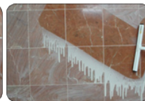
Step 4: Remove dirty solution. A wet/dry vac may be used.