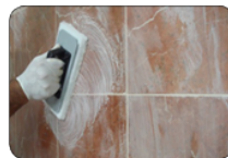
Step 3: Immediately scrub the surface - no dwell time is needed.