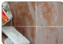
Step 2: Apply product direct to a slightly pre-wet white nylon pad.