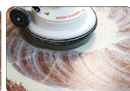
Step 3 Use a weighted slow speed scrubbing machine with hogs hair pad or tan pad.