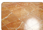
Step 1 Surface must be clean and free of all surface sealers and coatings

SAFETY DIRECTIONS: CORROSIVE - CONTAINS POTASSIUM OXALATE Wear protective gloves, eye & skin protection when using. Do NOT breath powder.