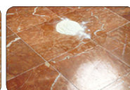
Step 2 Pre-wet a small area with water & add 1-2 cups of 5X Pro™ to form a slurry.