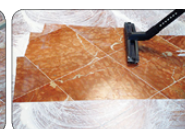
Step 5 When desired finish is achieved, then remove all slurry with wet vac and rinse thoroughly.